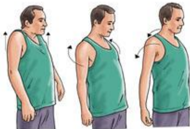
Scapular active range of motion