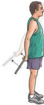
Wand exercise: Extension