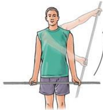
Wand exercise: Shoulder abduction and adduction