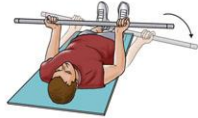
Wand exercise: External rotation