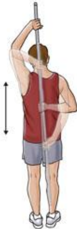
Wand exercise: Internal rotation