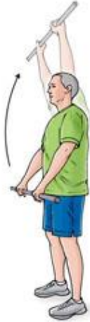
Wand exercise: Flexion